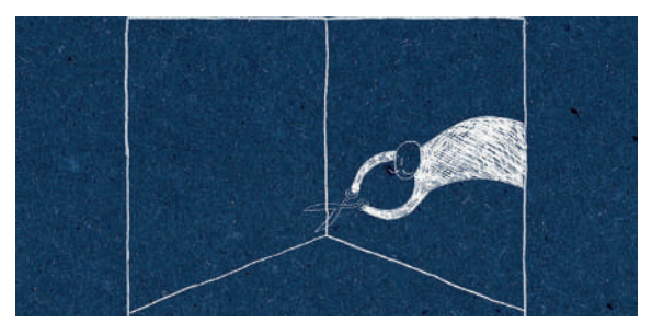
CROATIA / ESTONIA, 2016, 2 min.

Life isn't easy in a corner, in the angle where two edges meet. Everything is geometrically relative when perspective and the laws of gravity start playing tricks on you.